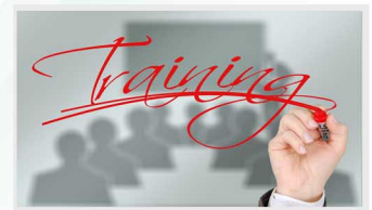
Training and Career Development